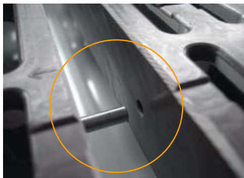
Simple fitting of the grates.

The innovative flooring types VI and VII are lined up next to each other and connected by means of stainless steel pins. Each element comes with a pin on one side and the respective receptacle on the other. The receptacle is marked on the grate. The elements are fit into each other in direction of the arrows and thus firmly connected. Disconnection of the grates is just as simple and fast which makes cleaning much easier.